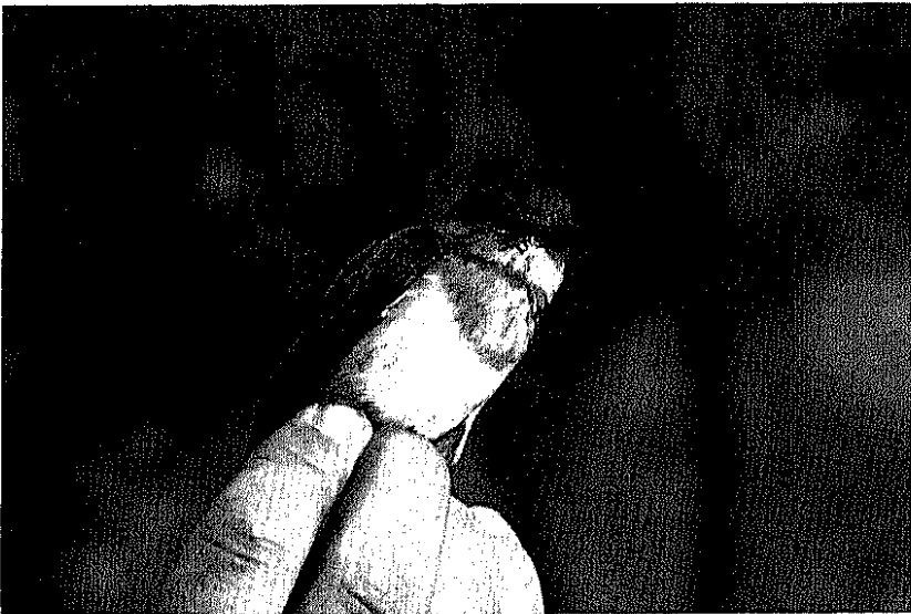
Figure 2. Swamp Flycatcher Muscicapa aquatica , Comoé N.P., 30 Nov 1994

Ficedula hypoleuca Pied Flycatcher. Abundant Oct–Apr in various habitats; 81 mist-netted. [Thiollay (1985) states that it is less common than Spotted Flycatcher Muscicapa striata , a species which was also observed but only frequently.]